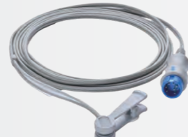
SpO 2 probe