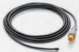
intracavity temperature probe