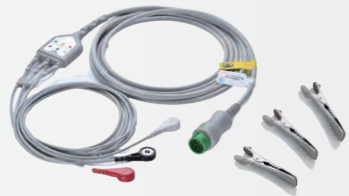
ECG lead +crocodile clip