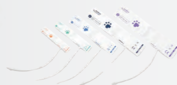
Multi-size NIBP cuff